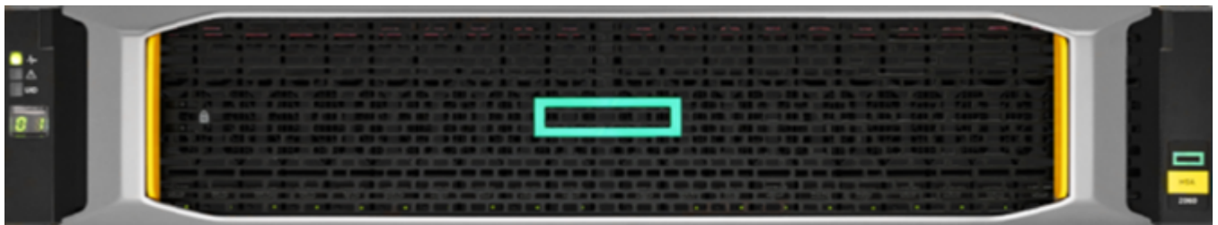
HPE MSA 1060 Storage

Designed to meet entry-level storage requirements, the HPE MSA 1060 Storage is a good fit for budget constrained customers. With one of the lowest entry price points in the Hewlett Packard Enterprise Storage portfolio and field-proven HPE ProLiant compatibility, the HPE MSA 1060 Storage is the platform of choice for smaller IT workloads. The HPE MSA 1060 Storage features 10GBASE-T iSCSI, Fibre Channel and SAS host interface connectivity at previously unattainable entry price points. The MSA 1060 allows users to take advantage of the latest storage technologies while also providing a balance between performance and budget.